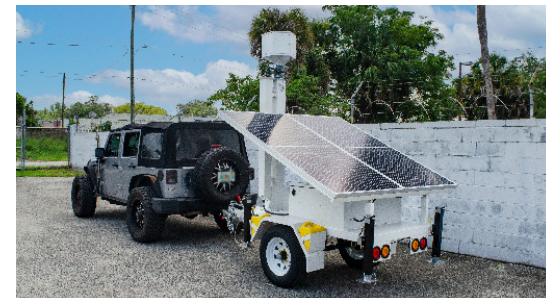
Department of Transportation Approved

HARNESS THE POWER OF THE SUN FOR UNINTERRUPTED SURVEILLANCE, MONITORING, AND CONNECTIVITY