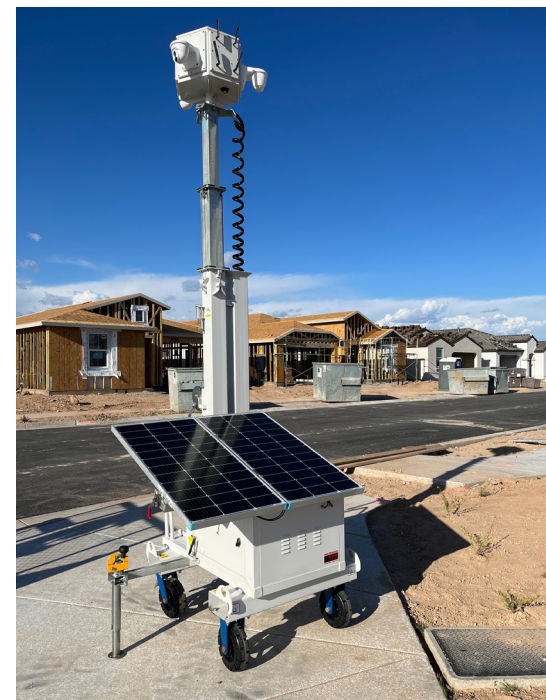
Carts and trailers rapidly deployable by a single person in less than 5 minutes