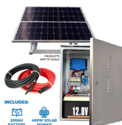
400W SOLAR POWER MODULE