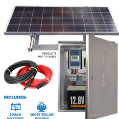
200W SOLAR POWER MODULE