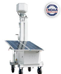
200W SOLAR POWERED MOBILE CART