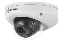
IP4MIADLP-28AI-NCV 4MP Armor Dome Camera w/ Analytics