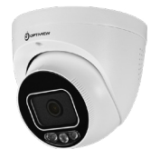
IP5MIAB-28-ADRB-NCV 5MP Active Deterrence Armor Ball w/ Starlight