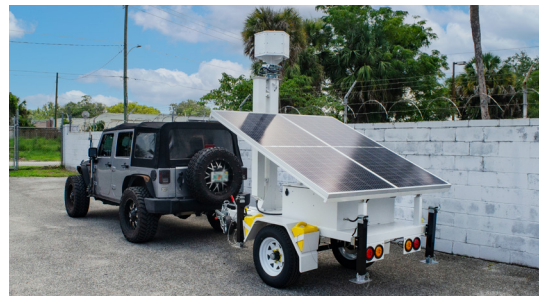
Department of Transportation Approved

HARNESS THE POWER OF THE SUN FOR UNINTERRUPTED SURVEILLANCE, MONITORING, AND CONNECTIVITY