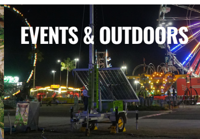
EVENTS & OUTDOORS