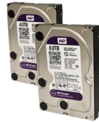
SURVEILLANCE DRIVES 4TB / 8TB