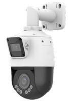
IP2MPTZ4SIRD-NCV 2MP Dual Lens Active Deterrent PTZ