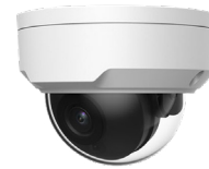
IP8MIAD-28-NCV 8MP 4K Fixed Armor Dome IP Camera