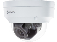
IP4MIAD-212-Z-NCV 4MP Motorized Zoom Armor Dome IP Camera