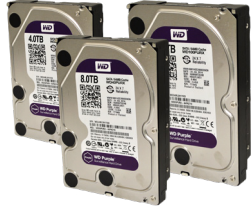
SURVEILLANCE DRIVES 4TB / 8TB / 10TB