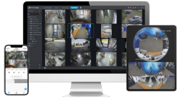
OPTIVIEW'S VIDEO MONITORING SOFTWARE Remote Monitoring