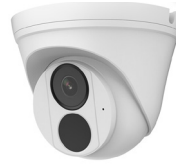
IP4MIAB-28-SDA-NCV 4MP Fixed Lens Armor Ball IP Camera