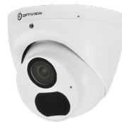
IP4MIAB-28-SDAM-NCV 4MP IP Armor Ball Camera w/ Built-in Mic