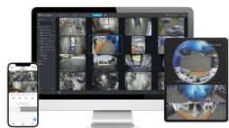
OPTIVIEW'S VIDEO MONITORING SOFTWARE Remote Monitoring