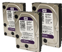
SURVEILLANCE DRIVES 4TB / 8TB / 10TB