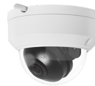
IP8MIAD-28A-NCV 8MP Fixed Armor Dome IP Camera w/ Mic