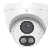
IP5MIAB-28-FC-NCV 5MP Full Color IP Camera w/Built-In Mic