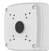
JB121 Junction Box for VMX series Cameras