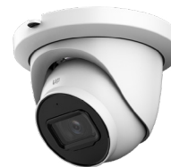
IP8MIAB-28S-AI 4K Fixed Armor Ball IP Camera w/ Analytics