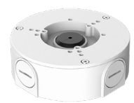
JB130 Junction Box for VMX series Cameras