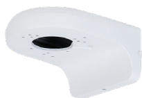
HDBKT-4 VMX Series Wall Mount Bracket