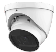
IP8MIAB-212-ZAM 8MP IR Varifocal Armor Ball IP Camera