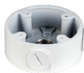
JB13A Junction Box for VMX series Cameras