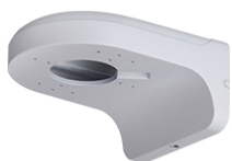
HDBKT-3 Armor Ball Camera Wall Mount Bracket