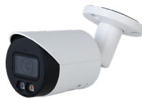
IP8MIBC-28-AI 8MP 4K Bullet Camera w/ Analytics w/ Mic