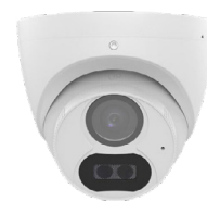
HDCD8M-28A-NCV 8MP Coax Armor Ball Camera w/ Mic