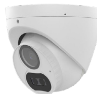
HDCD5M-28A-NCV 5MP Coax Armor Ball Camera w/ Mic