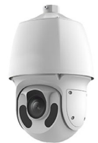
IP2MPTZ33-NCV 2MP Low Light PTZ with 33x Optical Zoom