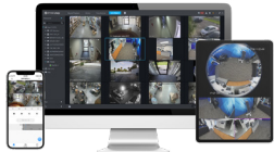
OPTIVIEW'S VIDEO MONITORING SOFTWARE Remote Monitoring