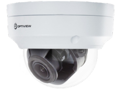
IP4MIAD-212-Z-NCV 4MP Motorized Zoom Armor Dome IP Camera