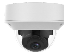
IP4MIAD-212-Z-NCV 4MP NDAA Compliant Armor Dome Camera