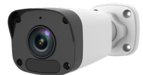
IP5MIBC-28-SDA-NCV 4MP NDAA Compliant Bullet Camera