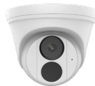
IP4MIAB-28-SDA-NCV 4MP NDAA Compliant Armor Ball Camera