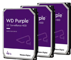
SURVEILLANCE DRIVES 4TB / 8TB / 10TB