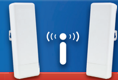
1.5 Mile Wireless Bridge