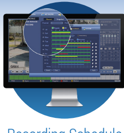
Recording Schedule Set Times, Dates & Camera Options