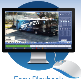
Easy Playback Calendar Search & Selectable Time Bars.