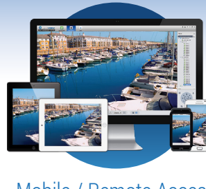
Mobile / Remote Access Access DVR Using Optiview VMS & Mobile Apps.